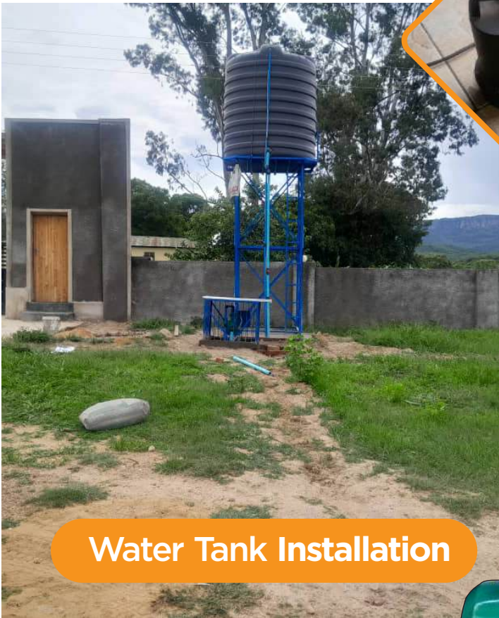
Water Tank Installation