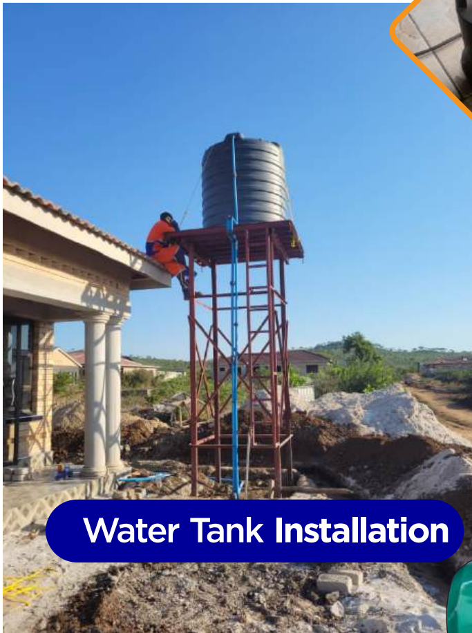
Water Tank Installation